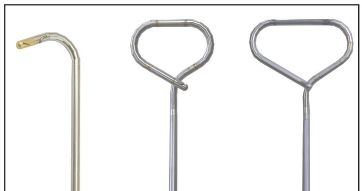
Ref. No. 91680